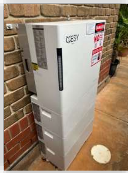
HM6-15 Adelaide, SA