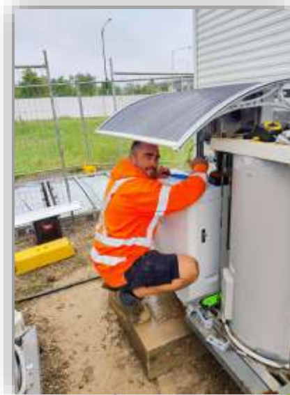
HM6-05 Off-grid: Gables, NSW