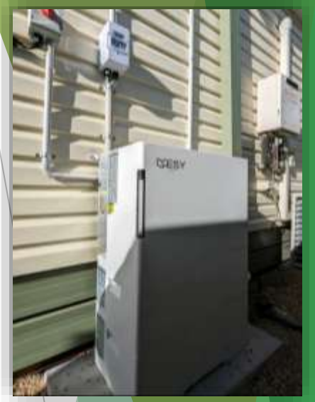
HM6-10 Moama, NSW