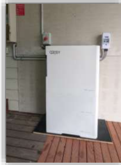
HM6-10 Barham, NSW