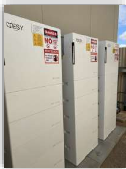
3*HM6-25 Port Augusta, SA