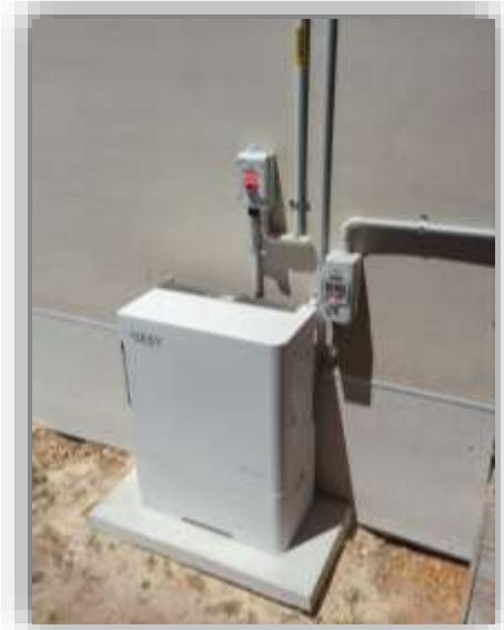
HM6-05 Bendigo, VIC