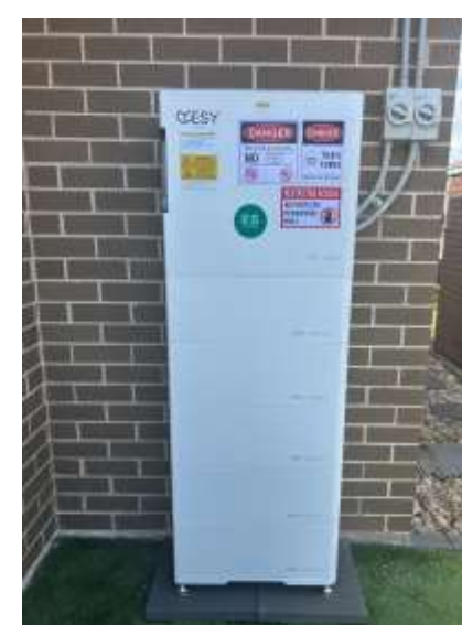
HM6-25 Oran Park, NSW