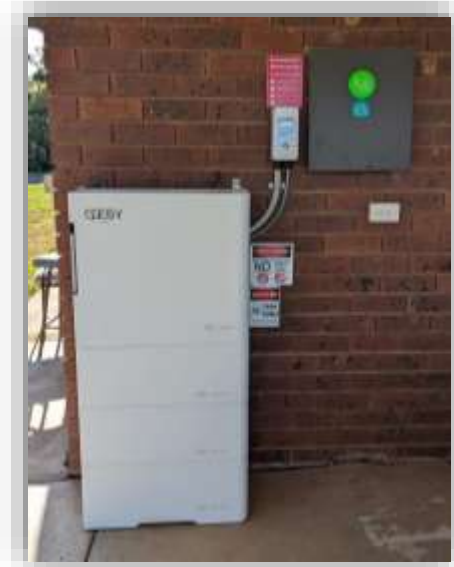
HM6-15 Echuca, VIC