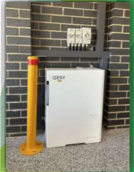
HM6-05 Central Coast, NSW