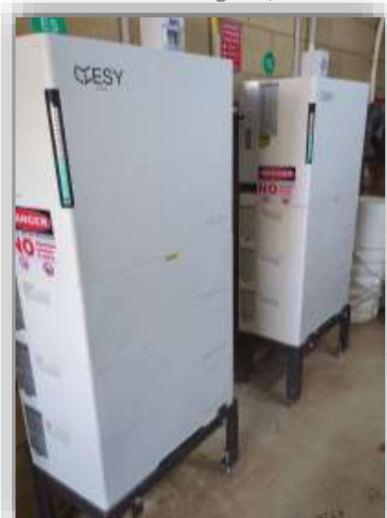
2*HM6-15 Dairy in Undera, VIC